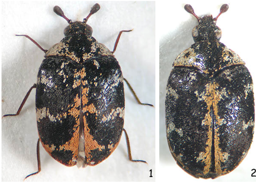
Figs 1-2. Habitus of Anthrenus (Anthrenus) scrophulariae (Linnaeus, 1758): 1- typical form, 2- var. suecicus .